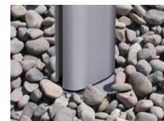
MKG23 | In-Ground Includes: In-ground fitting.

Note: External Stem required for Aquarius and Libra styles (sold separately).