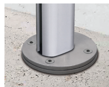
MKC23 | Concrete Includes: Adapter plate and expansion bolts.